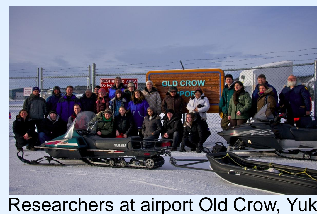
Researchers at airport Old Crow, Yukon