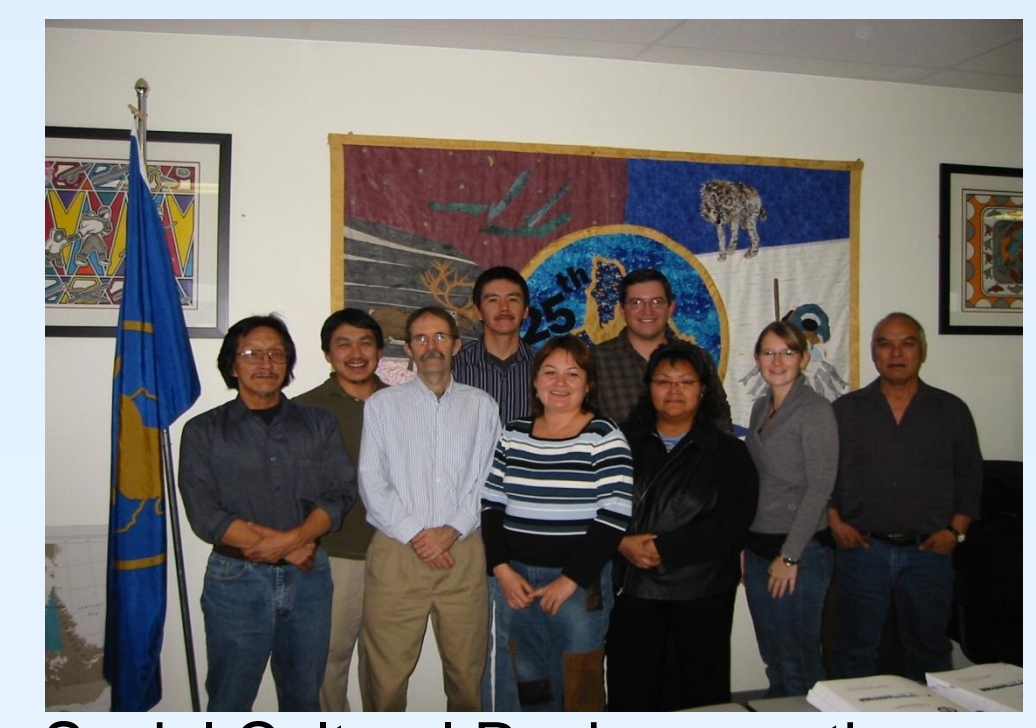
Social Cultural Review meeting Kuujuaq, Nunavik