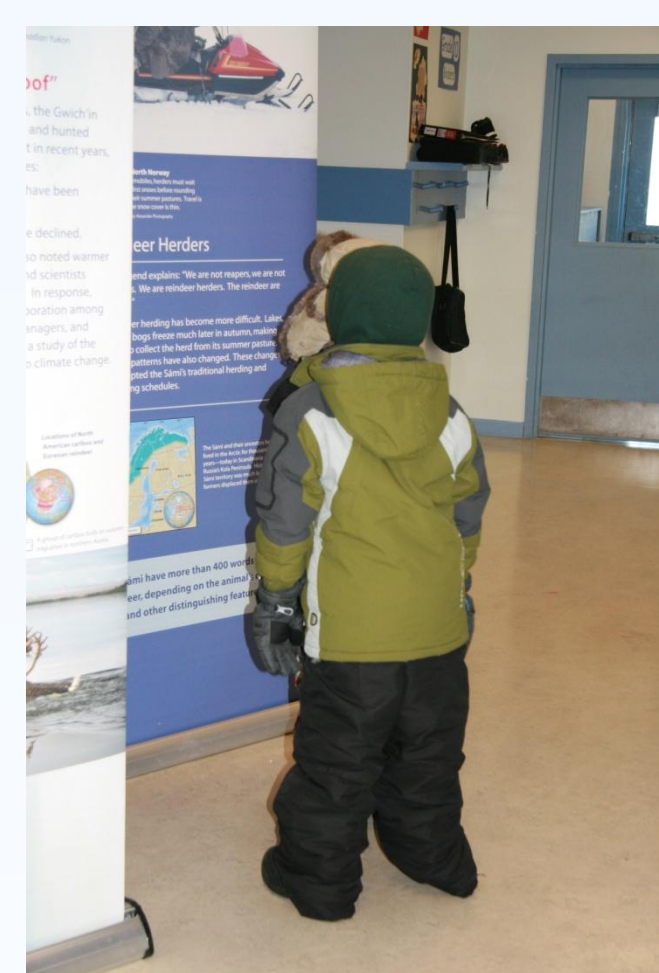
A Friend Acting Strangely exhibit Paulatuk, NWT