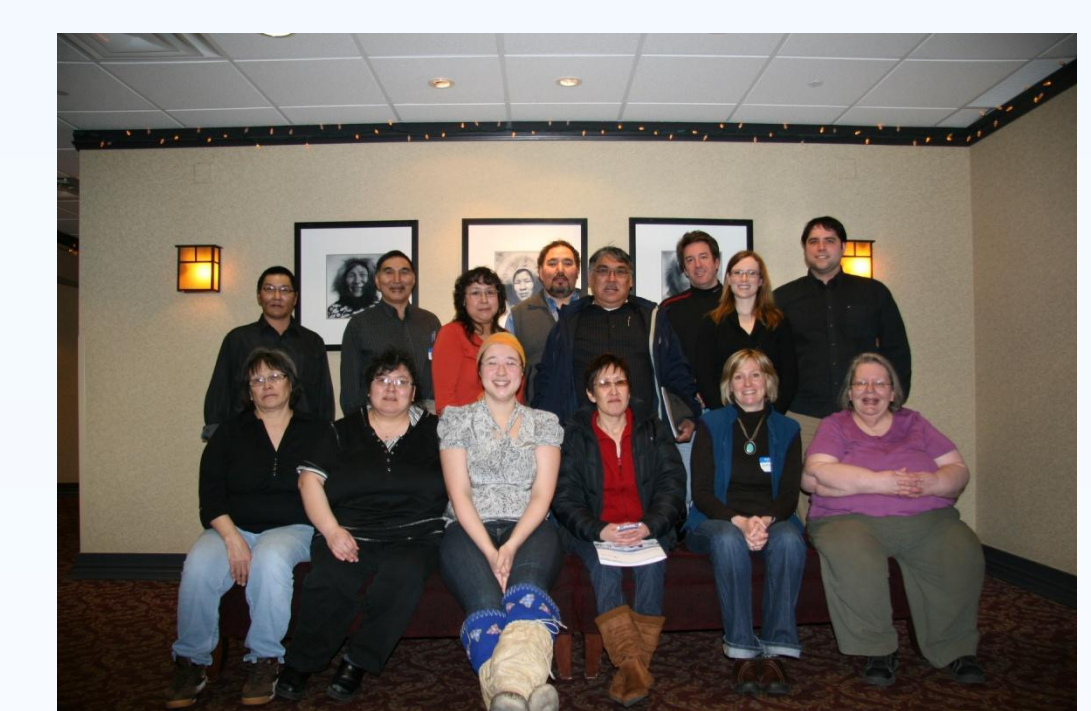
CARLI community workshop in Iqaluit, NU