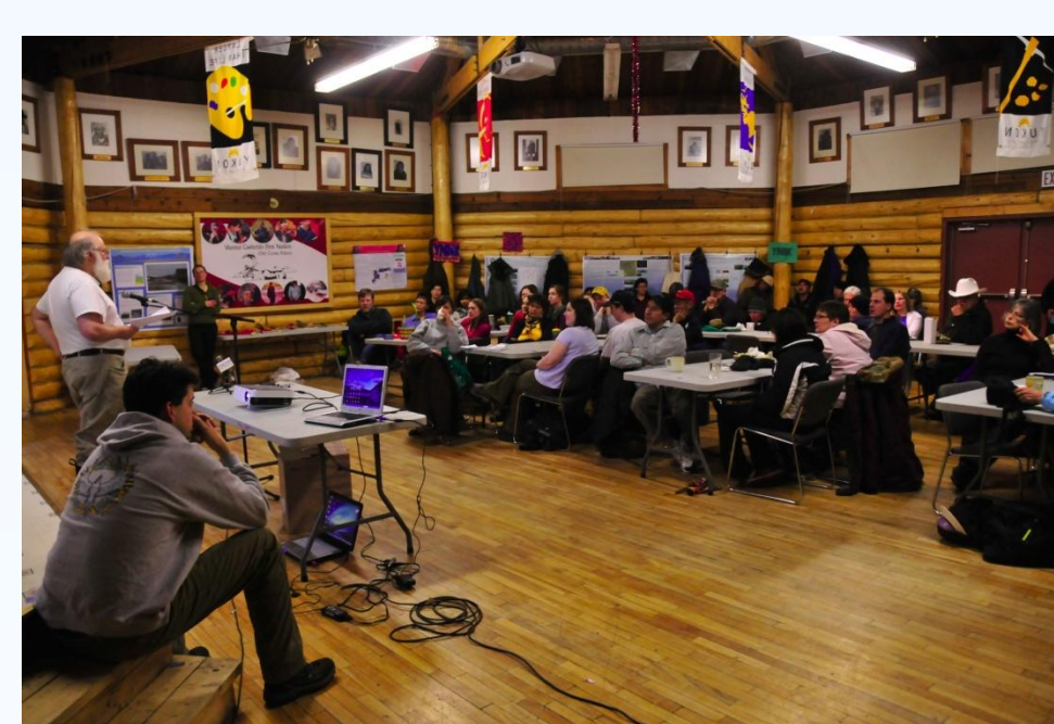
Annual meeting at Old Crow, Yukon