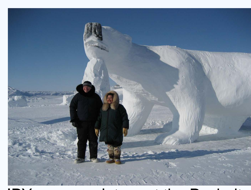
IPY snow sculpture at the Puvirnituq Snow Festival